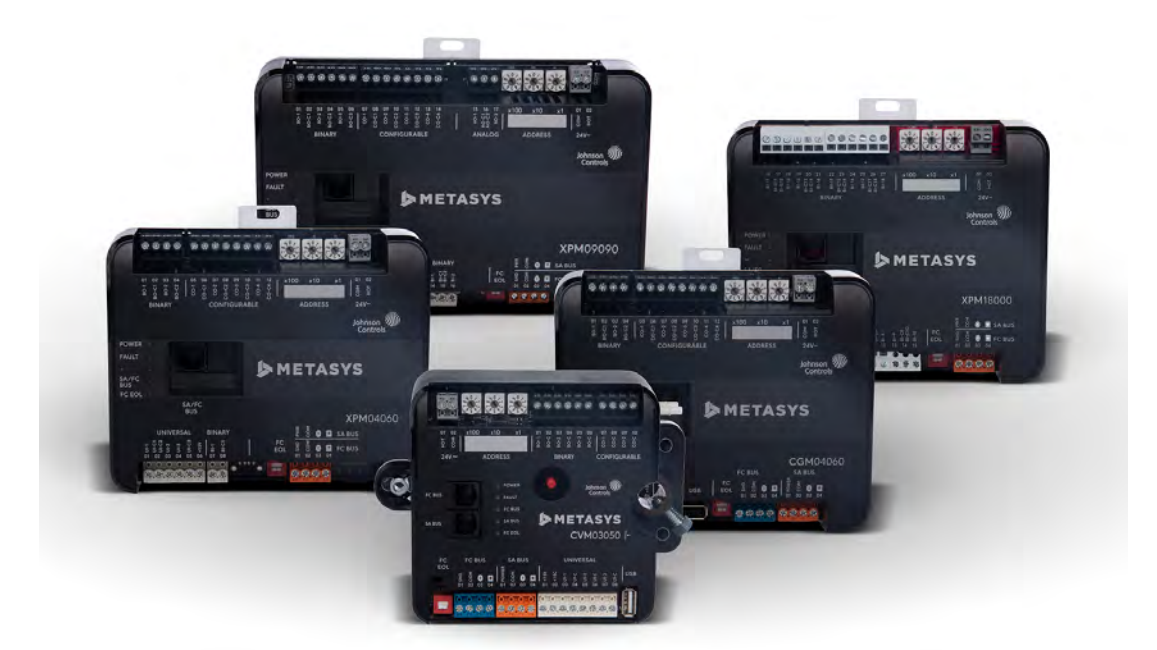
Figure 1: Metasys CG and CV Series Equipment Controllers and XPM Expansion Modules

The CG and CV series equipment controllers feature an advanced design that provides optimum performance. These controllers run pre-engineered and user-programmed applications and provide the I/O required to monitor and control a wide variety of HVAC equipment. These controllers are designed to install easily and communicate through standard RS485 BACnet MS/TP protocol, which enables you to build a variety of equipment controller network applications, ranging from simple fan coil, heat pump, or VAV control applications to advanced central plant management and stand-alone applications. The CG and CV series equipment controllers also provide easy access to power, network, and field terminations.